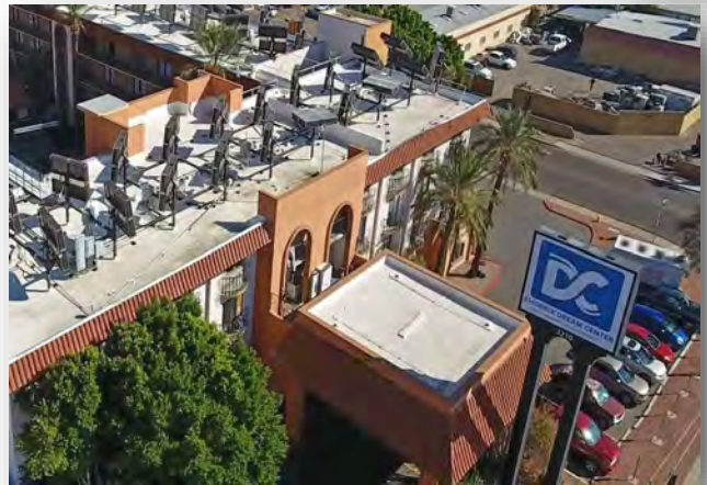
PHOTO: Dream Big with the Phoenix Dream Center whose mission is to stop human trafficking, end childhood hunger, and educate at-risk youth to be tomorrow's leaders.