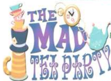
Table Sponsors will be recognized in print materials, online and live at the event!

Payments can be made online at genesisprojectaz.com/donate or by mail to PO Box 5156 Apache Junction AZ 85178