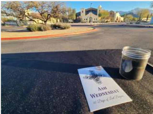
Below: “Ashes to Go” - Pastor Katharine imposed ashes on 65 persons during the day on Ash Wednesday.