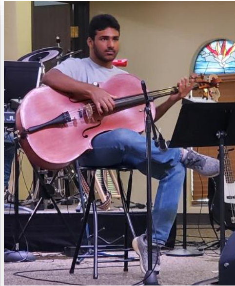
Thank you for your continued prayers and support for our students and their families!