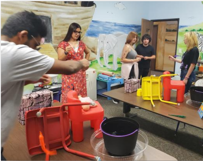
Our Youth Praise Band is growing! Come and join our fun Youth Group on Sundays at 11am.