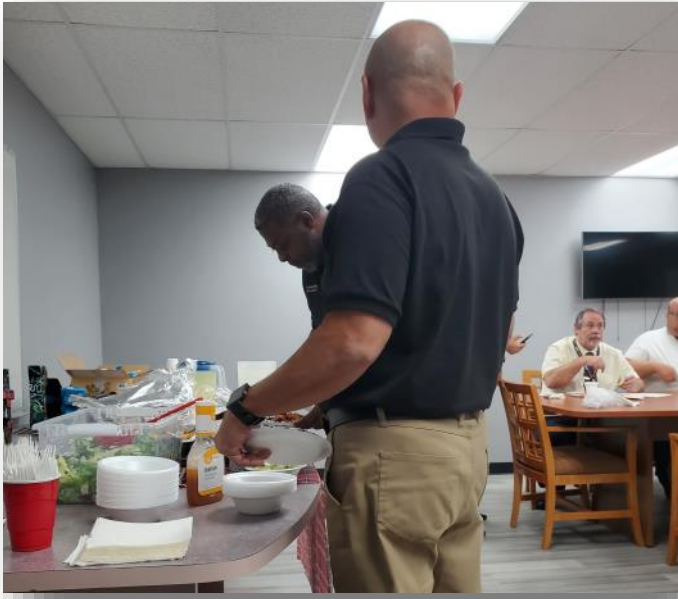
We made a maze to remind us that it sometimes takes a little work to get your reward!