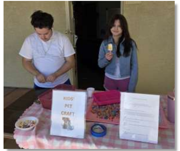
High school youth Sunday school at the park on a beautiful Sunday morning.