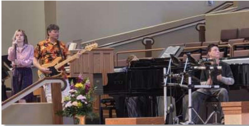
Youth helping with Worship Services on March 1st.