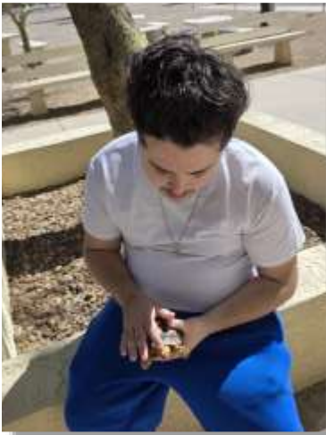
Lots of "turtliffic" fun at the GCUMC Pet Blessing.